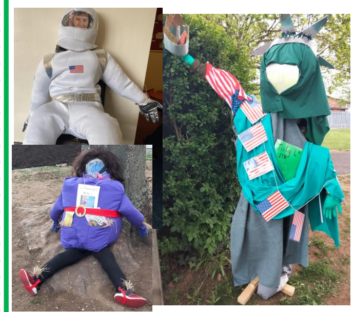
Hessle Scarecrow T Saturday 15th May - Sunday 23rd May

Keep a look out for our scarecrows over the next week.