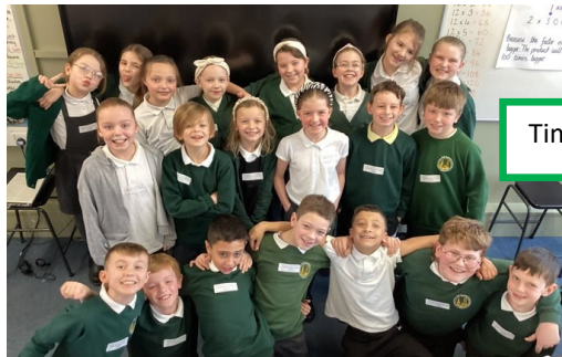
Times table success in Year 4!