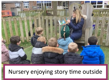
Nursery enjoying story time outside