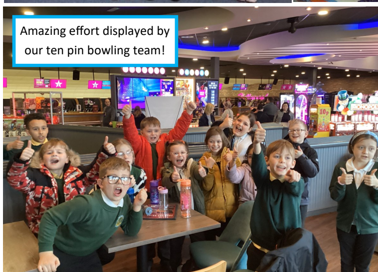
Amazing effort displayed by our ten pin bowling team!