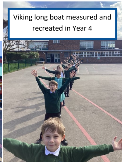
Viking long boat measured and recreated in Year 4