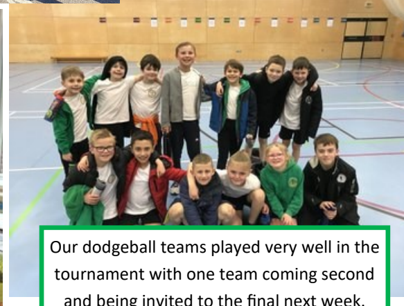
Our dodgeball teams played very well in the tournament with one team coming second and being invited to the final next week.