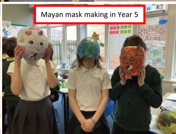
Mayan mask making in Year 5