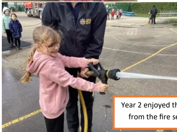
Year 2 enjoyed their visit from the fire service