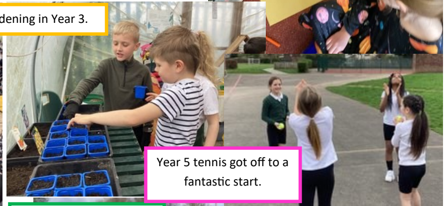
Year 5 tennis got off to a fantastic start.