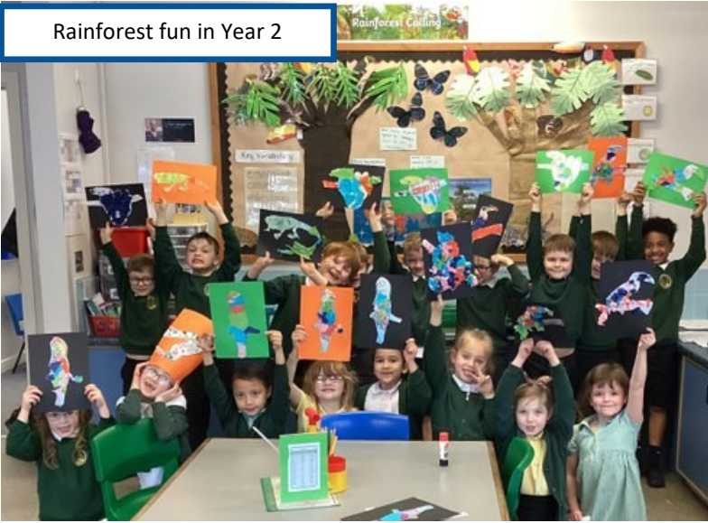
Rainforest fun in Year 2