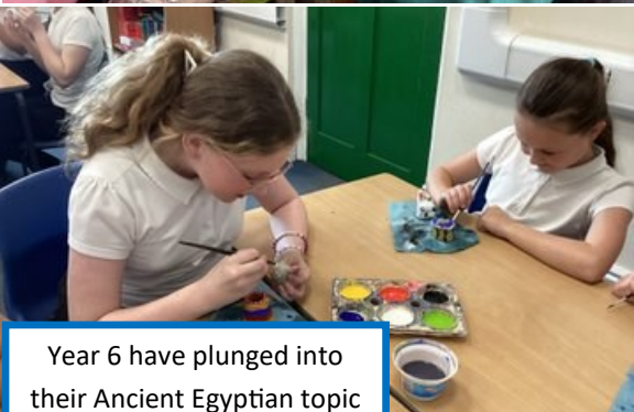
Year 6 have plunged into their Ancient Egyptian topic