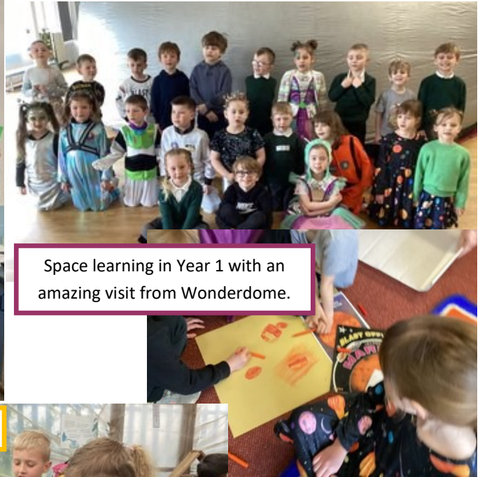
Space learning in Year 1 with an amazing visit from Wonderdome.