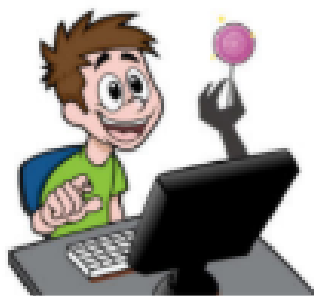
A Parent's Guide to Online Grooming