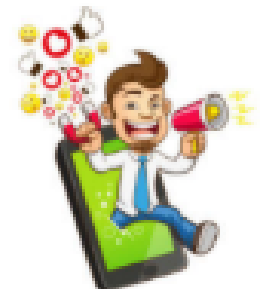
A Parent's Guide to Live Streaming