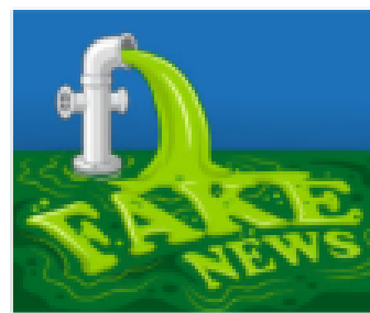
A Parent's Guide to Fake News