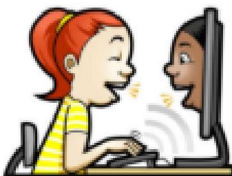
A Parent's Guide to Social Media