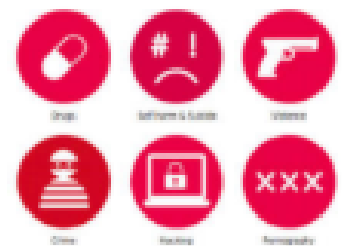
A Parent's Guide to Privacy Settings

Online safety is when young people know who they can tell if they feel upset by something that has happened online.